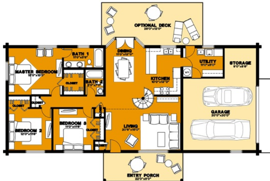
THE HEARTHSTONE MODEL 1ST FLOOR PLAN TOTAL LIVABLE 1596 SQ.FT. GARAGE 624 SQ.FT. PORCHES 176 SQ.FT.

With 3 spacious bedrooms and a large living area, The Hearthside is a well-designed home. The total home has a truss roof system with a 5/12 pitch. The ceiling of the front porch, garage and bedroom area are flat, and the kitchen, dining and living rooms areas are scissor trusses.