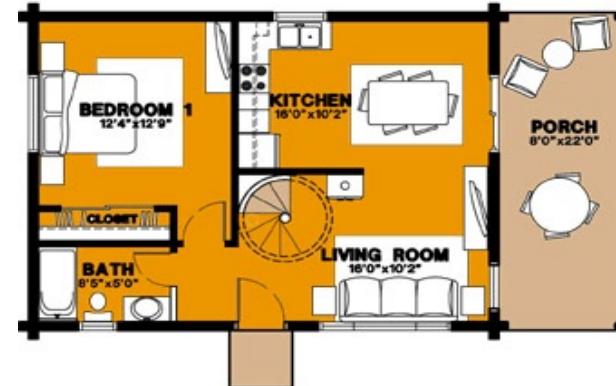
THE SNOWFLAKE MODEL 1ST FLOOR PLAN

1ST FLOOR PLAN 660 SQ. FT. 2ND FLOOR PLAN 286 SQ. FT. TOTAL LIVABLE 946 SQ.FT. PORCHES 176 SQ.FT.