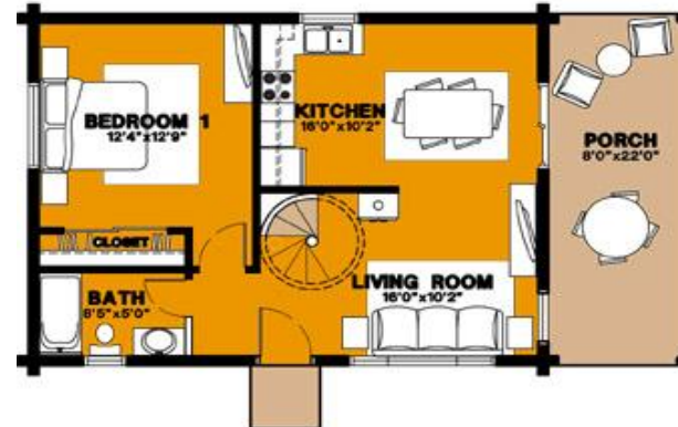
THE SNOWFLAKE MODEL 1ST FLOOR PLAN

1ST FLOOR PLAN 660 SQ. FT. 2ND FLOOR PLAN 286 SQ. FT. TOTAL LIVABLE 946 SQ.FT. PORCHES 176 SQ.FT.