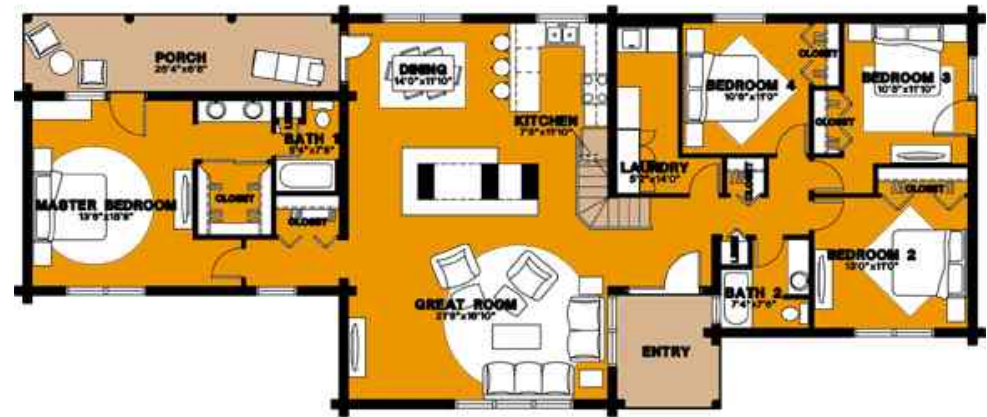
THE PINWOOD MODEL 1ST FLOOR PLAN

1ST FLOOR PLAN 1989 SQ. FT. 2ND FLOOR PLAN 351 SQ. FT. TOTAL LIVABLE 2340 SQ.FT. PORCHES 172 SQ.FT.